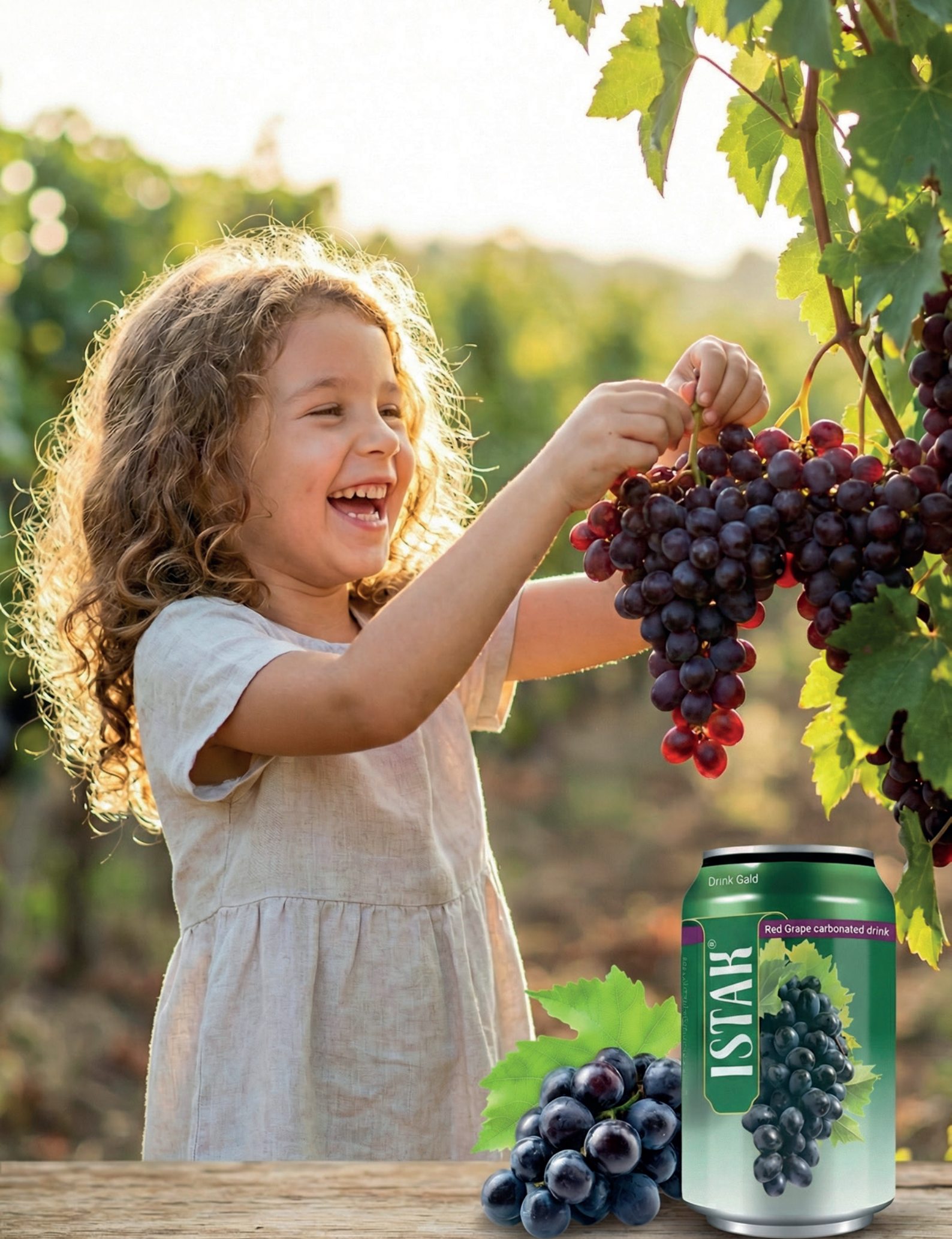
Red Grape Carbonated Drink